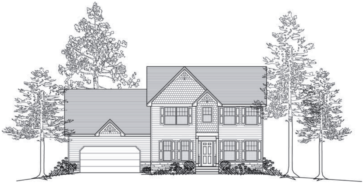
Photo shows an RGB Jenkins design rendering and may show optional features which vary from the standard plan. Refer to the floor plan for standard plan features which you may customize to make your new RGB home everything you want it to be.