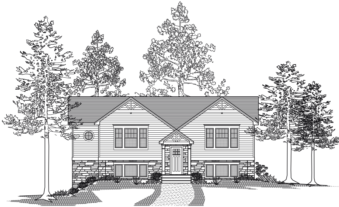
Photo shows an RGB Jenkins design rendering and may show optional features which vary from the standard plan. Refer to the floor plan for standard plan features which you may customize to make your new RGB home everything you want it to be.