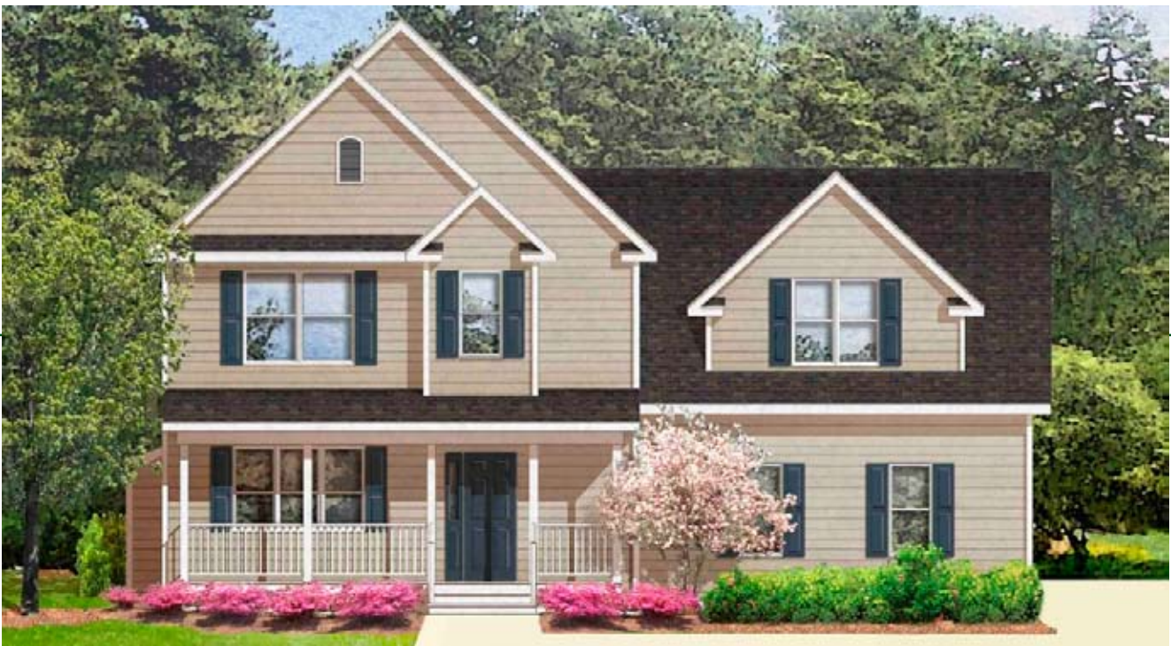
Photo shows a rendering of an RGB custom design and may show optional features which vary from the standard plan. Refer to the floor plan for standard plan features which may be customized to make your new RGB home everything you want it to be.