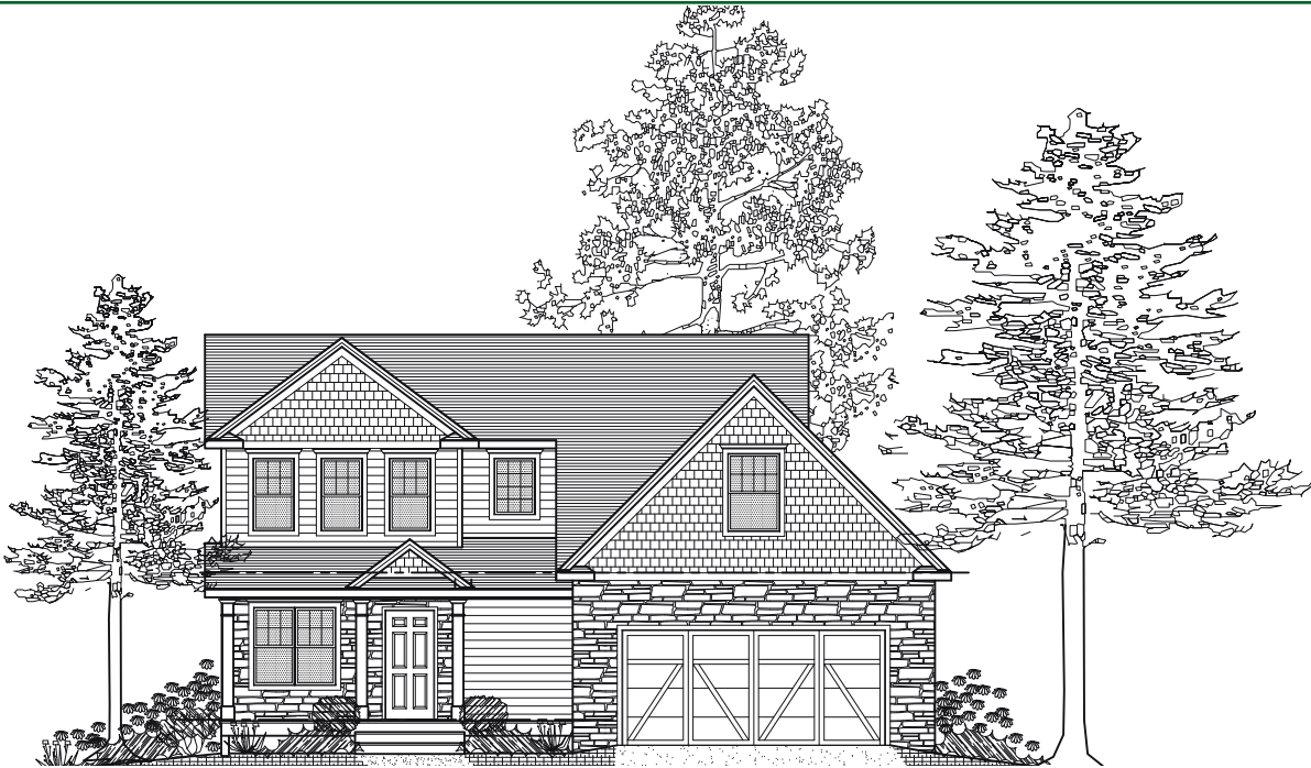
Photo shows an RGB Willow design rendering and may show optional features which vary from the standard plan. Refer to the floor plan for standard plan features which you may customize to make your new RGB home everything you want it to be.