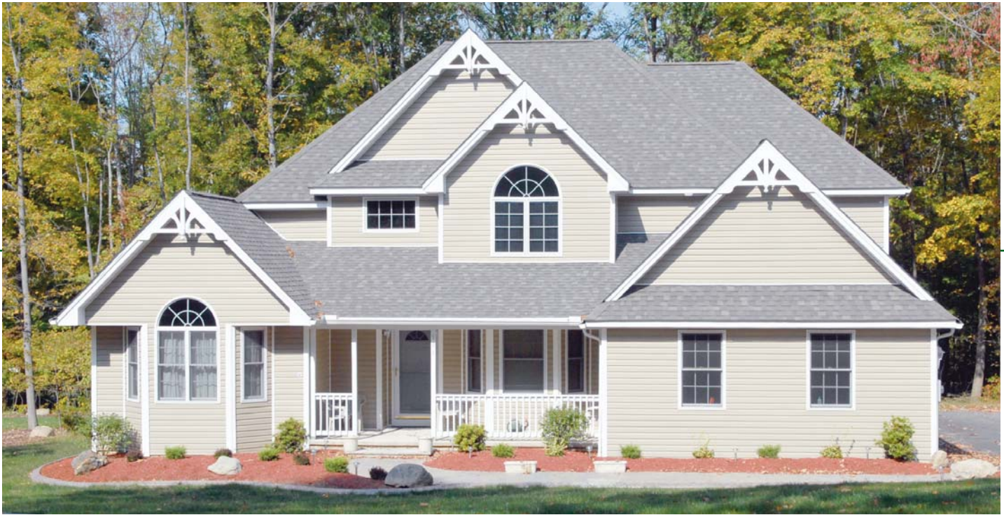
Photo shows an RGB Avista design custom built for an individual RGB homebuyer and may show optional features which vary from the standard plan. Refer to the floor plan for standard plan features which you may customize to make your new RGB home everything you want it to be.