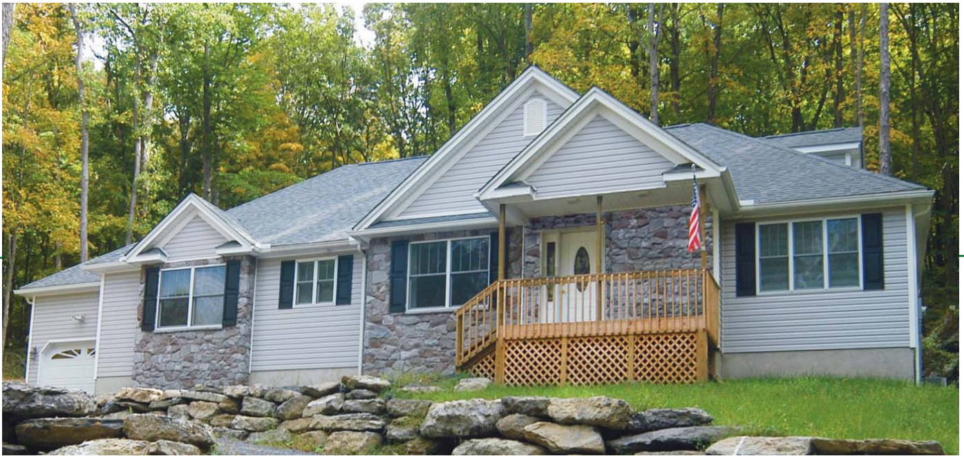
Photo shows an RGB Newport design custom built for an individual RGB homebuyer and may show optional features which vary from the standard plan. Refer to the floor plan for standard plan features which you may customize to make your new RGB home everything you want it to be.