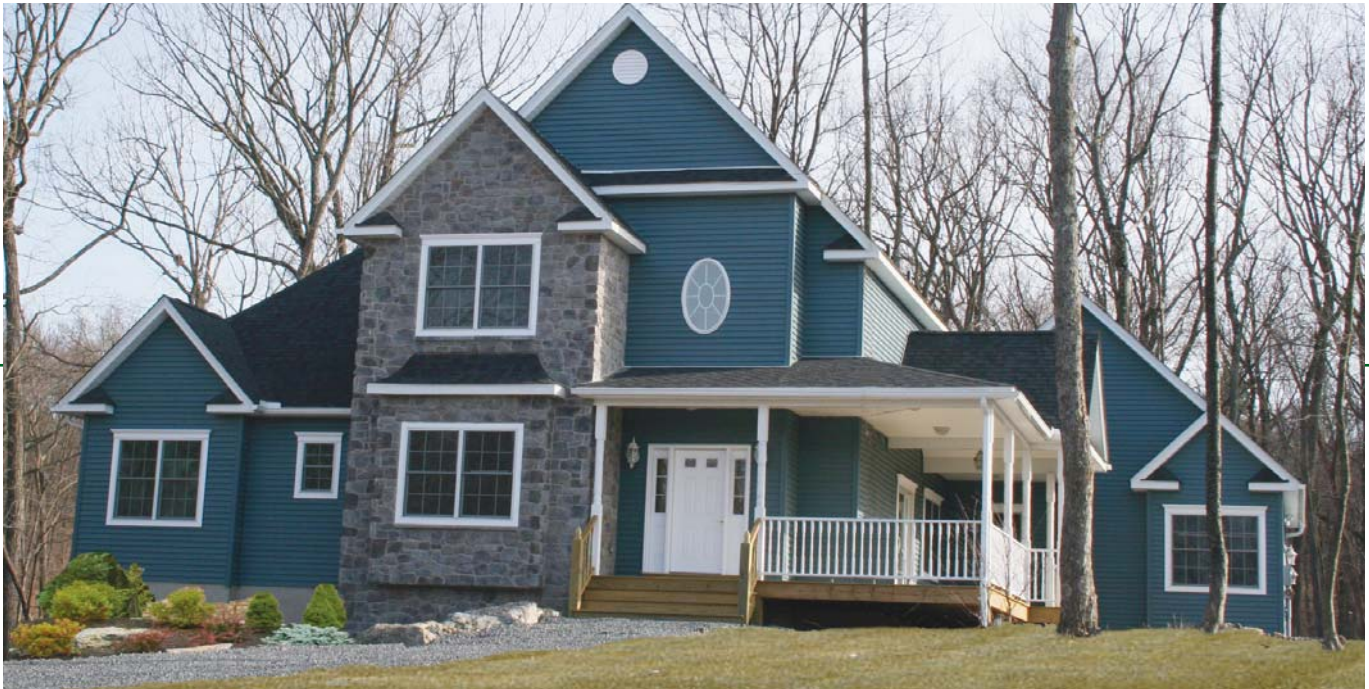
Photo shows an RGB under construction Paramount design being custom built for an individual RGB homebuyer and may show optional features which vary from the standard plan. Refer to the floor plan for standard plan features which you may customize to make your new RGB home everything you want it to be.