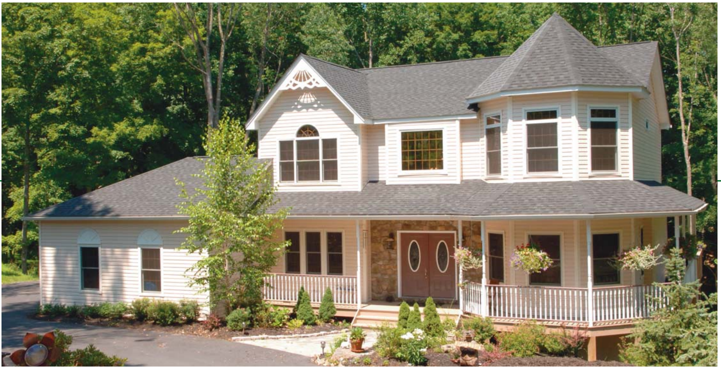
Photo shows an RGB Queen Anne II design custom built for an individual RGB homebuyer and may show optional features which vary from the standard plan. Refer to the floor plan for standard plan features which you may customize to make your new RGB home everything you want it to be.