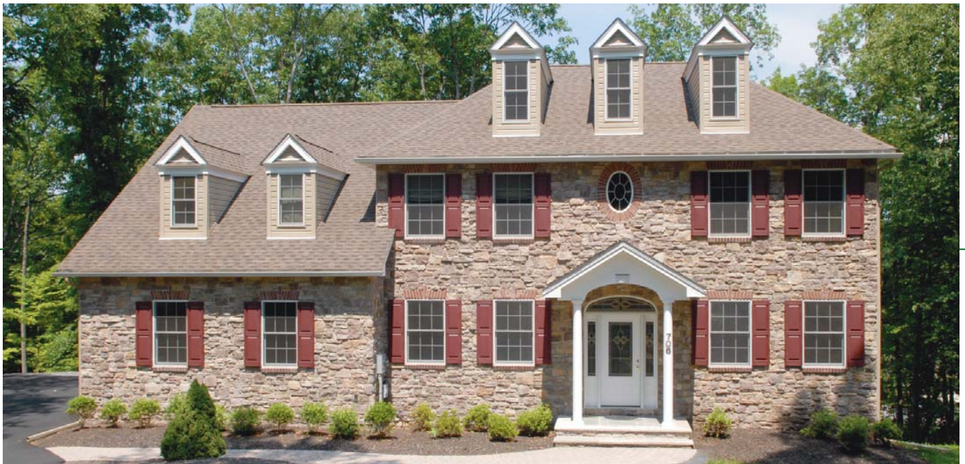
Photo shows an RGB Raleigh design custom built for an individual RGB homeowner with optional stonework and three dormers which are options to the standard plan. Refer to the floor plan for standard plan features which you may customize to make your new RGB home everything you want it to be.